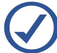
CIPD Best Practice