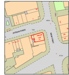
SITE PLAN @ 1 : 1250 (North Up)