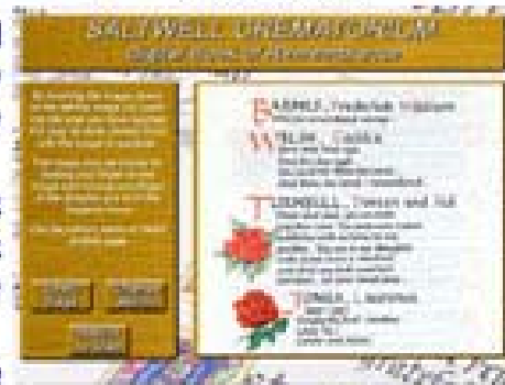
Final Zoomed Entry

Opposite are some samples of screen shots that you will see while using the kiosk.