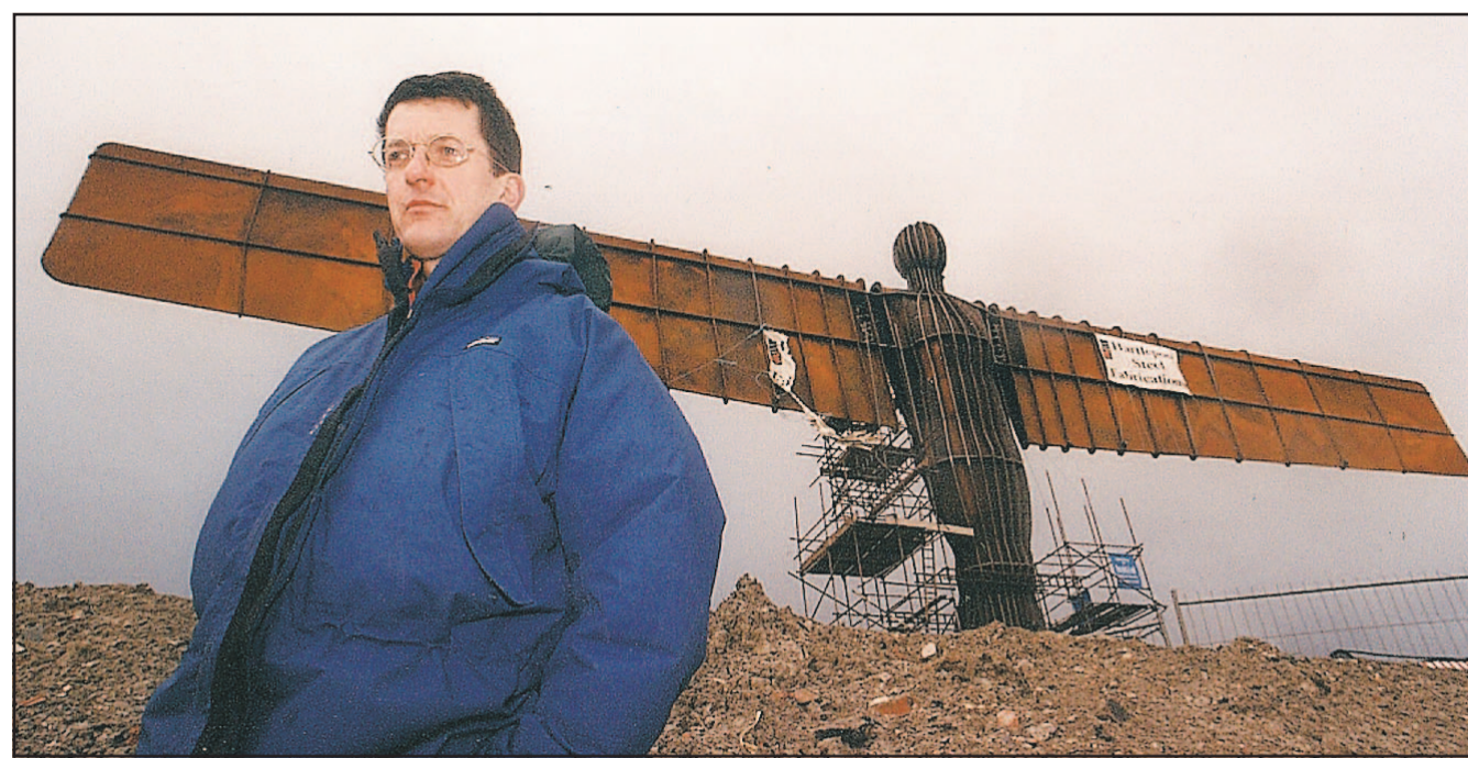
PROUD MOMENT: Artist Antony Gormley watched the Angel rise