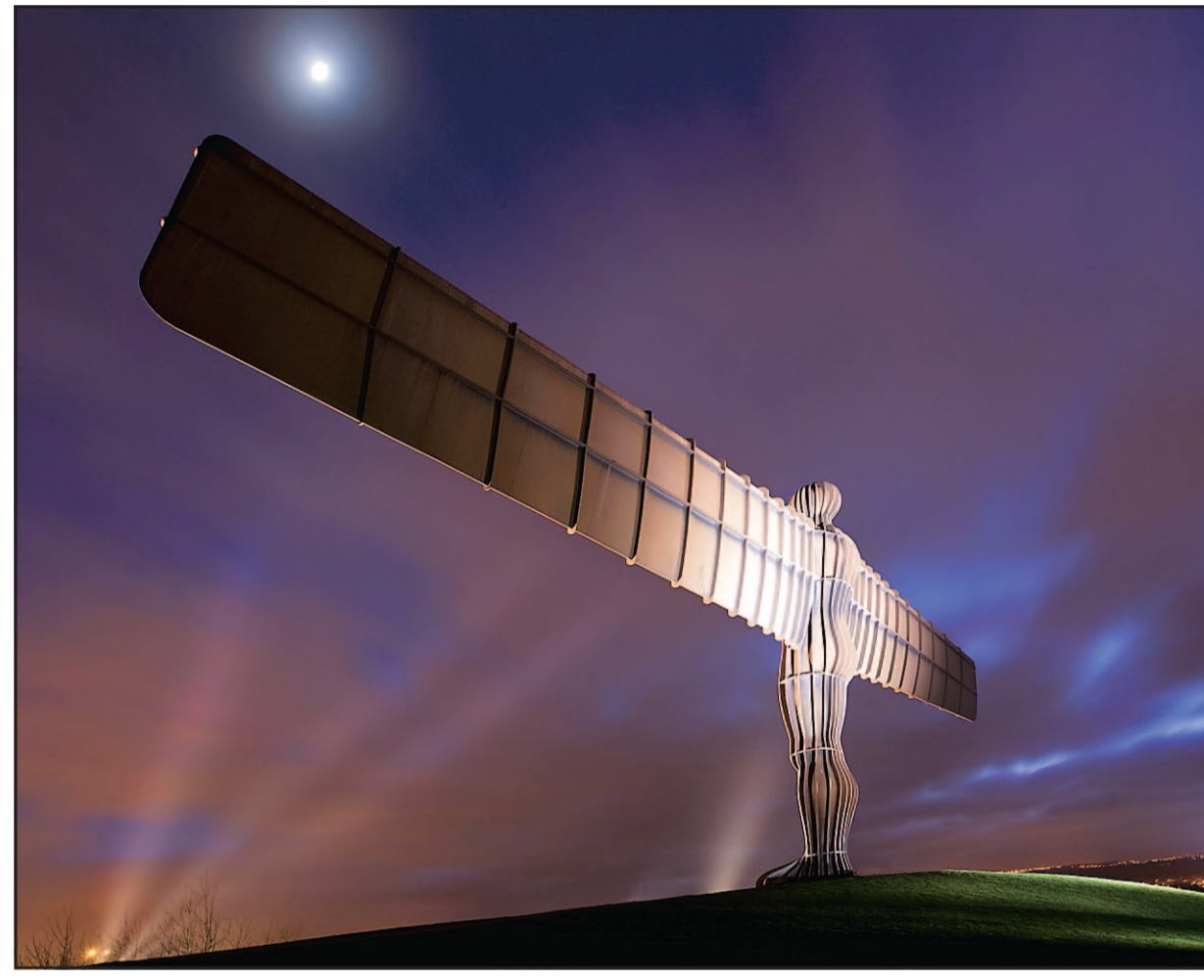
IN THE SPOTLIGHT: The Angel is bathed in white light for the first time in 10 years