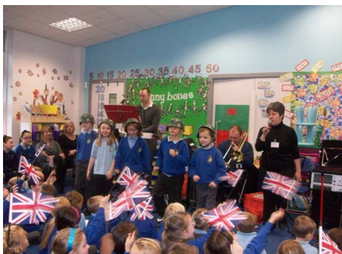
Whole School Gateshead Music Service Workshop: Popular Music Throughout The Ages

The curriculum is often enriched by the opportunity to visit places of interest or by inviting specialist groups into school. Due to our location we often visit Chopwell Woods so that children discover first hand the changing seasons in the woods and develop an appreciation of the local environment and heritage.