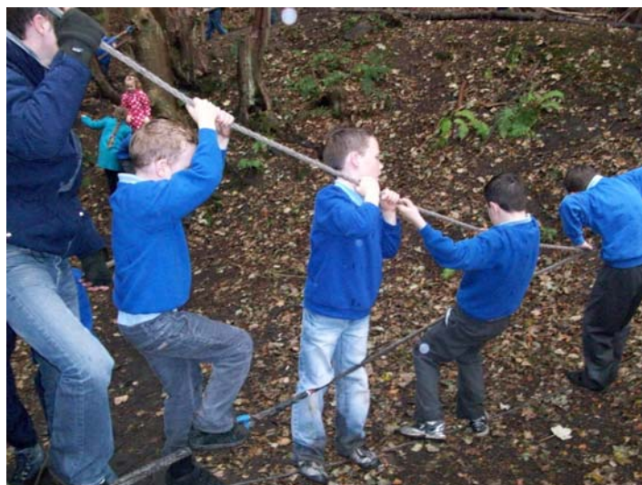
Year 3 and 4 at Gibside

Homework activities are given to consolidate and extend learning and to encourage children's organisational skills. Tasks are generally set in context with the learning taking place in school. Parents are encouraged to share and discuss homework tasks with their children. Depending on the age and ability of the child different amounts and types of homework will be set. In addition, every child will be given a reading book and reading diary; this is for parents to comment on the progress of their child and promotes a dialogue between teacher and parent.